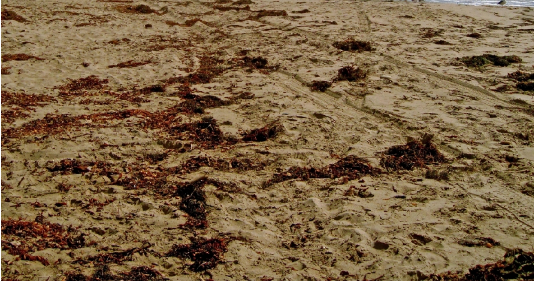
The beach at Leo Carillo State Park acts as a reference beach