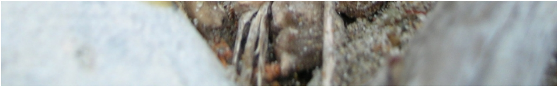
A killdeer chick at Isla Vista Beach