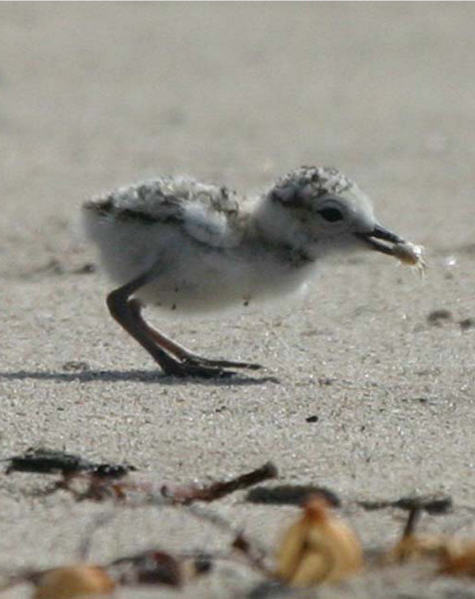
Snowy plovers dine on beach hoppers