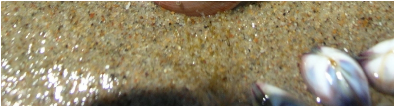
Clams at Santa Claus Beach